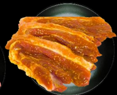
40 | Keli Samgyeobsal Kerrie Pork €12,00