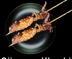
22 | Ojing-eo Kkochi Squid Skewer €4,00