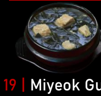
19 | Miyeok Guk Seaweed Stew €8,00