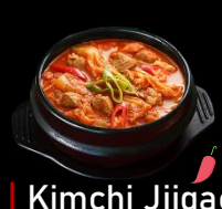
18 | Kimchi Jjigae Kimchi Stew €8,00