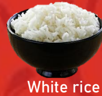
White rice White rice €1,00