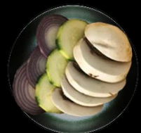
48 | Yachae Vegetable mix €8,00