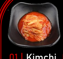
01 | Kimchi Kimchi €2,50