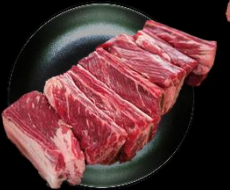
35 | Galbi Beef ribs €13,00