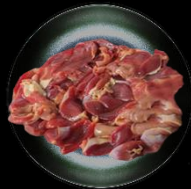
37 | Dalg Wi Chicken Stomach €12,00