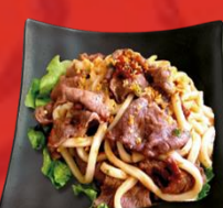
29 | Beef Udon Stir-Fried Beef Udon €8,00