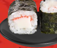
10 | Kani Maki Crab €3,90 (3 pcs)

AVAILABLE FOR EXTRA COSTS (2 EURO EXTRA PER PORTION)