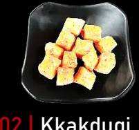
02 | Kkakdugi Pickled Radish €2,50