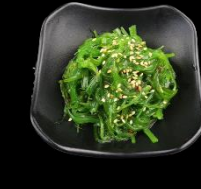
05 | Hae Cho Seaweed €2,50