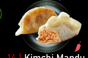
14 | Kimchi Mandu Kimchi, Pork €2,50 (2 pcs)