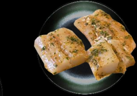
43 | Pangasiuseu Marinated Fish €12,00