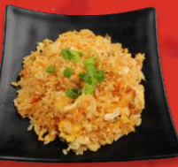
30 | Kimchi Rice Kimchi Fried Rice €8,00