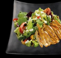
07 | Chicken Salad Chicken, Lettuce €4,50