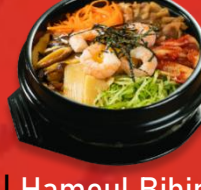
27 | Hameul Bibimbap Seafood Mixed Rice €12,00