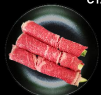
47 | Soegogi Lol Zucchini, Beef €10,00