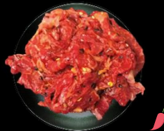
32 | Maeun Soegogi Spicy Beef €13,00