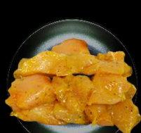
38 | Dak Keli Chicken Kerrie €12,00