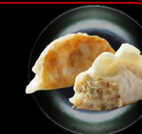
13 | Chicken Mandu Chicken filling €2,50 (2 pcs)