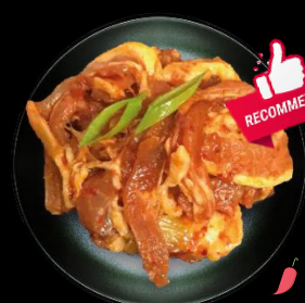
41 | Daeji Bulgogi Marinated Pork €12,00