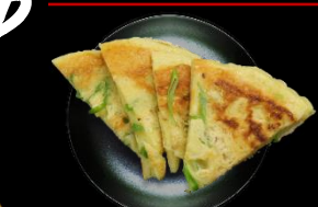
12 | Pa-Jeon Seafood Pancake €4,00 (4 pcs)