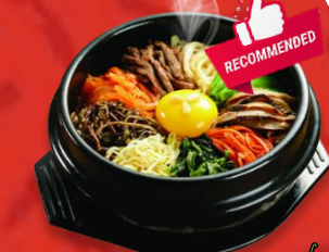
28 | Bibimbap Beef, vegetable Mixed rice €11,00