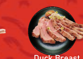
Duck Breast €15,00 for A La Carte