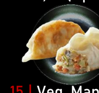
15 | Veg. Mandu Vegetarian €2,50 (2 pcs)