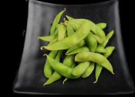
06 | Soybeans Soybeans €4,50