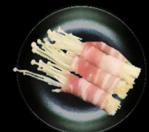
46 | Enoki Lol Enoki, Pork €10,00