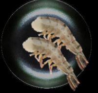
45 | Saeu Shrimp €12,00