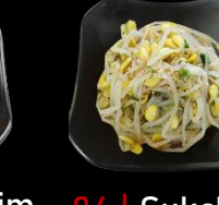
04 | Sukchu Muchim Bean Sprouts €2,50