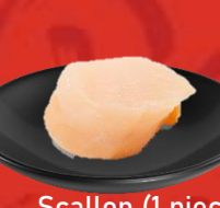
Scallop (1 piece) €2,50 for A La Carte