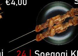
24 | Soegogi Kkochi Beef Skewer €4,00