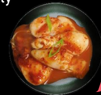
44 | Ojing-eo Squid €12,00