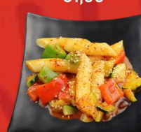
31 | Tteokbokki Stir-Fried Rice Cakes €8,00