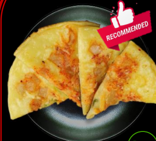
11 | Kimchi Jeon Kimchi Pancake €4,00 (4 pcs)