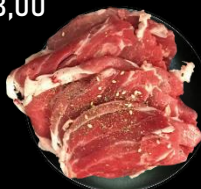
39 | Yang Kogi Lamb €13,00