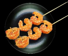
21 | Sewoo Kkochi Shrimp Skewer €4,00