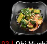
03 | Ohi Muchim Cucumber €2,50