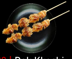
20 | Dak Kkochi Chicken Skewer €3,80