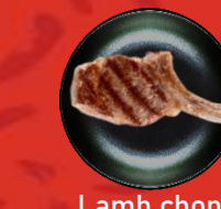
Lamb chop €4,00 for A La Carte

AVAILABLE FOR EXTRA COSTS (2 EURO EXTRA PER PORTION)