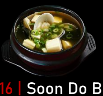
16 | Soon Do Bu Seafood Tofu Stew €8,00