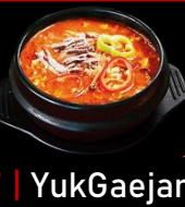
17 | YukGaejang Beef, veggie €8,00