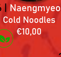
26 | Naengmyeon Cold Noodles €10,00