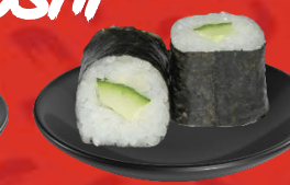
09 | Kappa Maki Cucumber €2,00 (3 pcs)