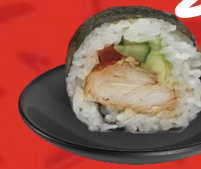
08 | Chicken roll Chicken, Radish €3,90 (3 pcs)