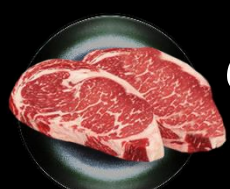
33 | Deungsim Beef sirloin €13,00